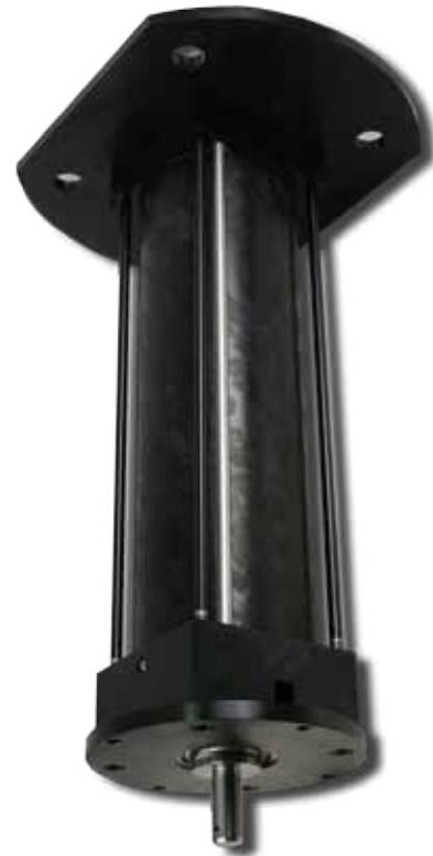
Crust Breaker Cylinder